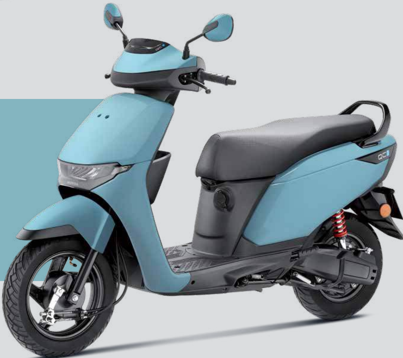
Pearl Shallow Blue