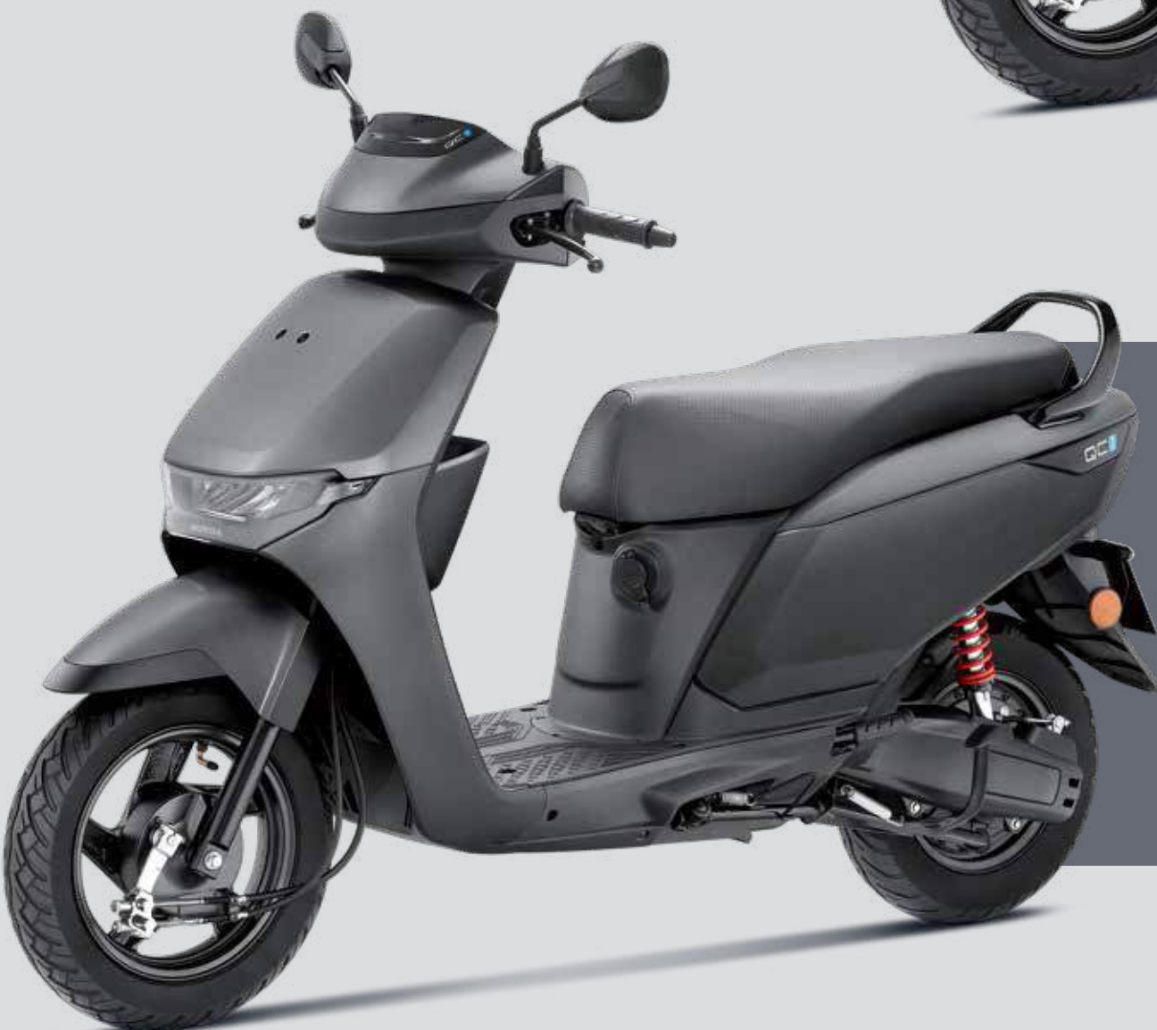
Matt Foggy Silver Metallic