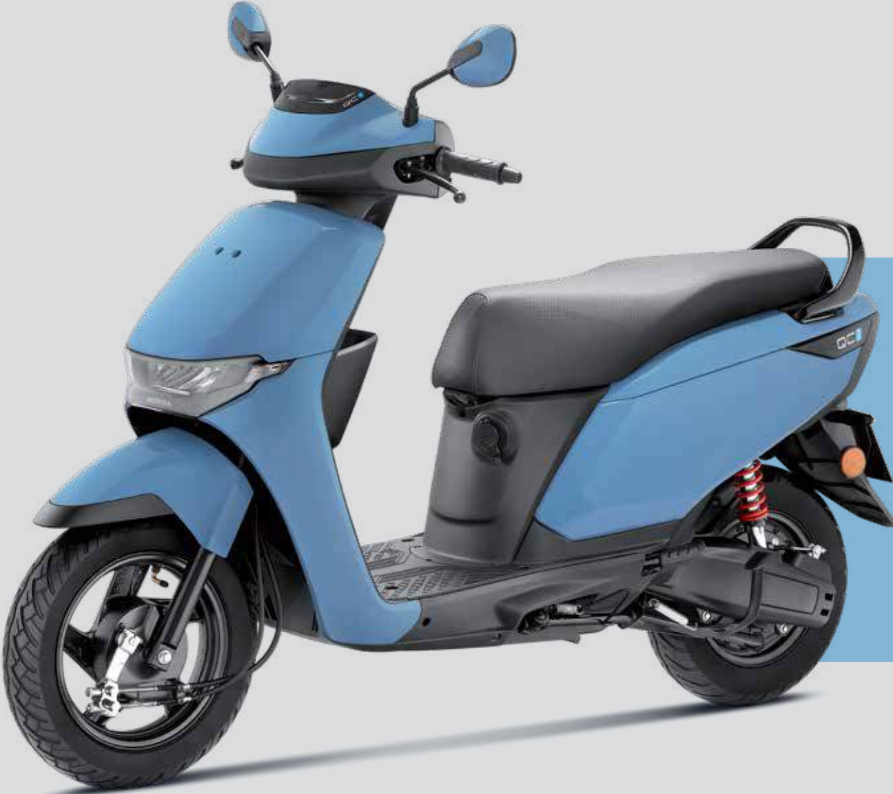
Pearl Serenity Blue

Choose from a range of stunning colours that reflect your personality.