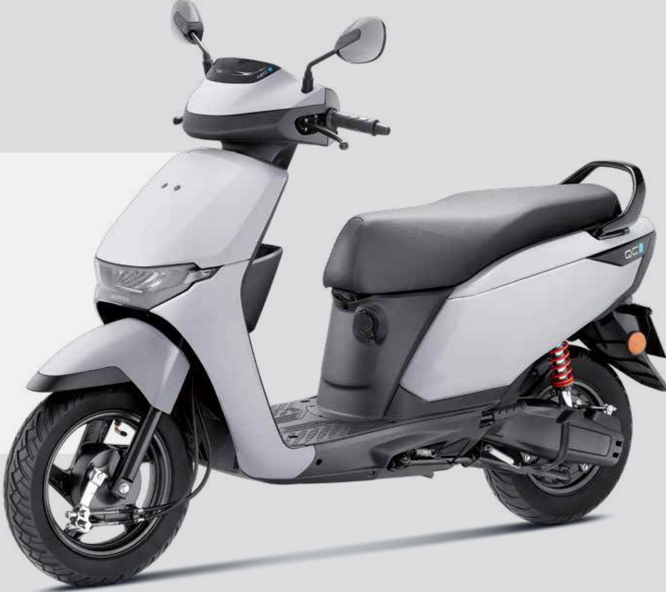
Pearl Misty White